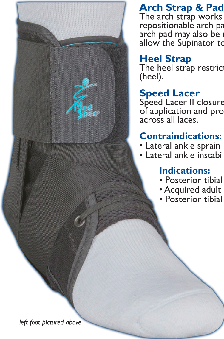
left foot pictured above