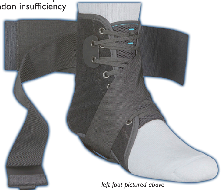
left foot pictured above